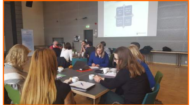
KISA project in Uppsala region

Further information at: www.kisaprojektet.se