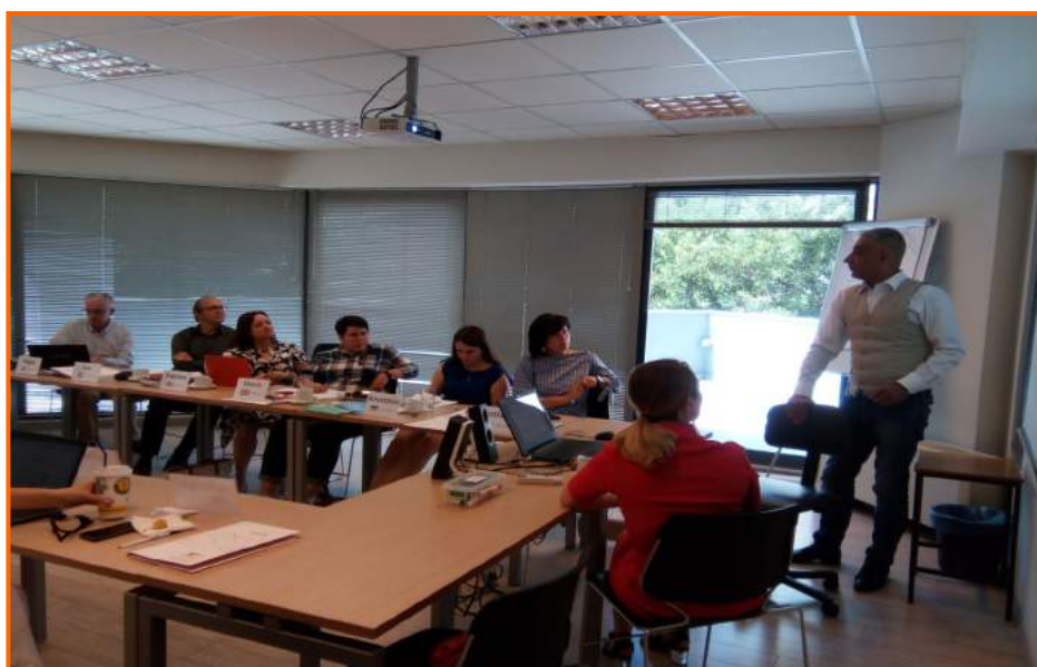
2 nd transnational meeting in Larissa, Greece

The Igamma-Femina partners also discussed and agreed upon the next key steps required to successfully implement and achieve the outcomes for all the Intellectual Outputs of this project as well as for the Management and Dissemination processes. Finally, it was agreed that the next meeting of the project will take place in the UK on 25 th and 26 th of January 2018 where the partners will be focusing on the development of the Igamma-Femina methodology.