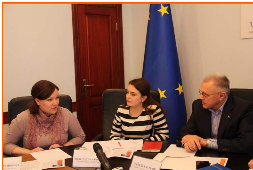
Igma-Femina press conference in Vinnytsia, Ukraine