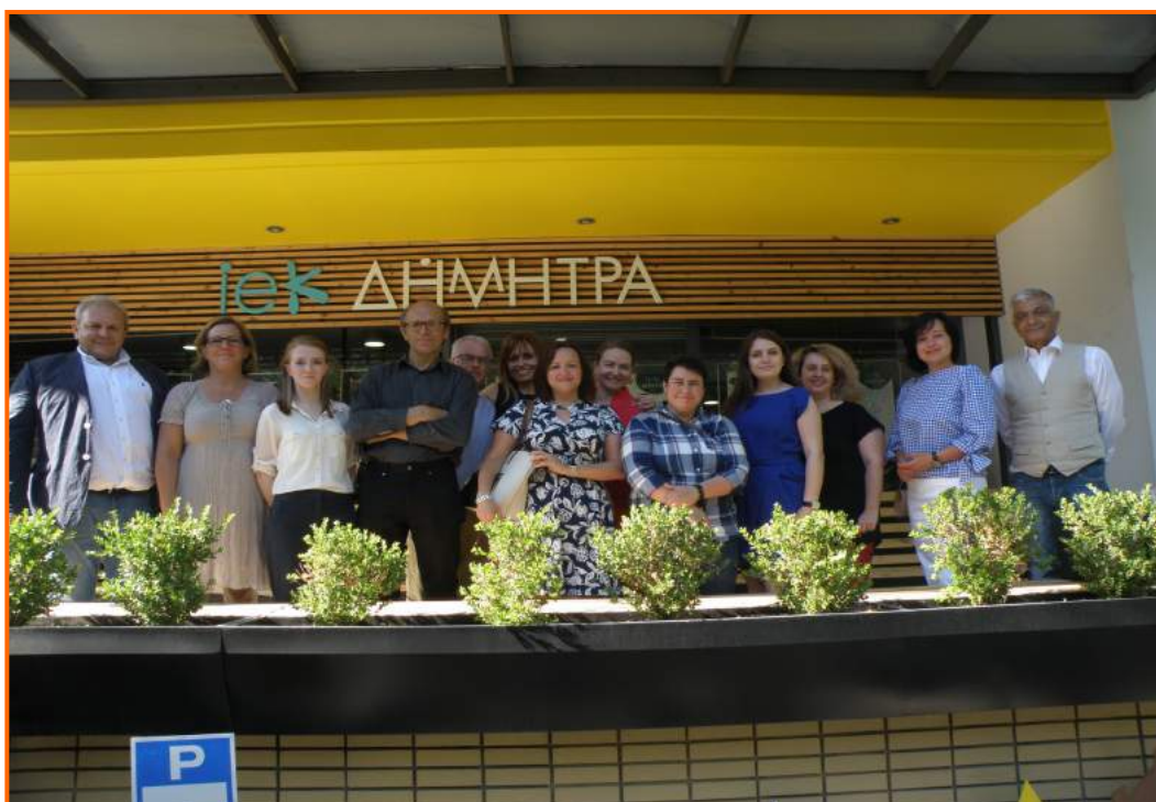
2 nd transnational meeting in Larissa, Greece